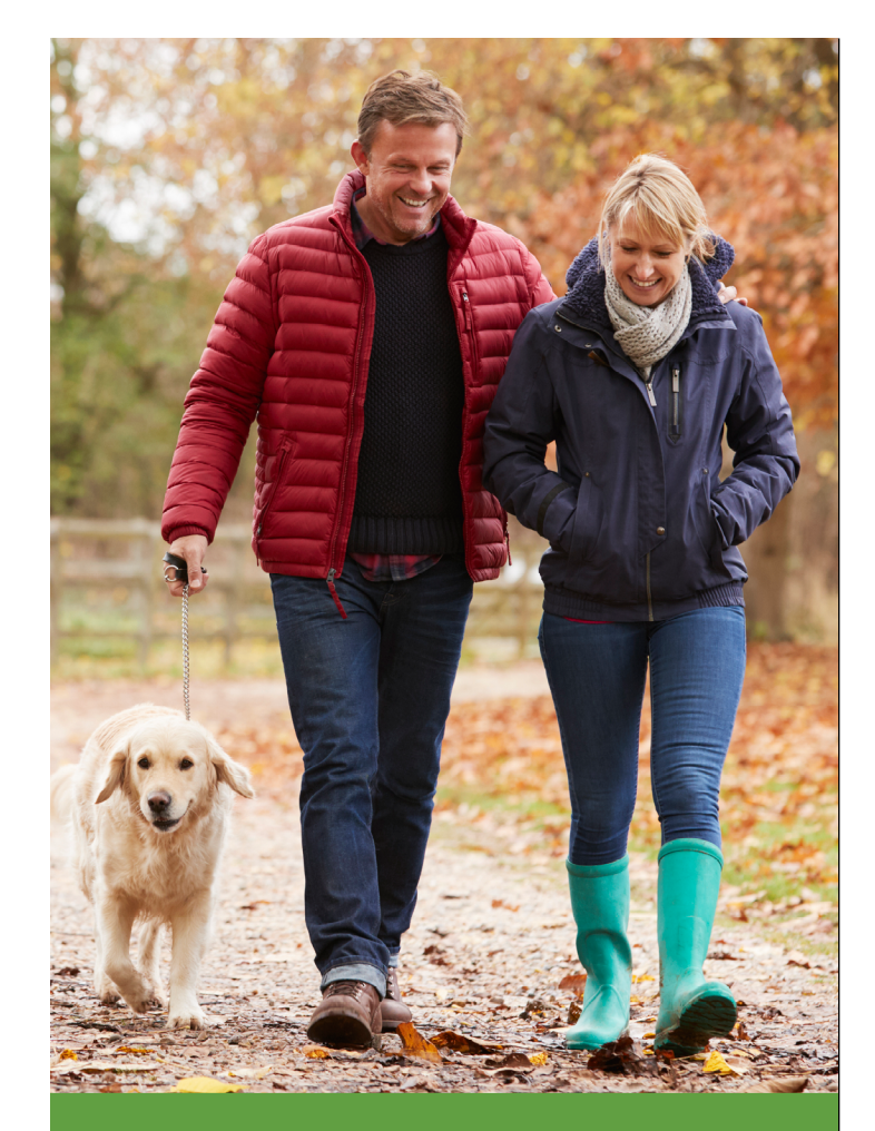
Let us help you choose the best options for preserving your wealth.

The payments to the stepchildren were in the nature of bequests, not payments for adequate consideration, so the deduction was denied. A late filing penalty was added to the bill because even though the settlement with Holly had not yet been reached, the estate did have sufficient information to file a return. \square